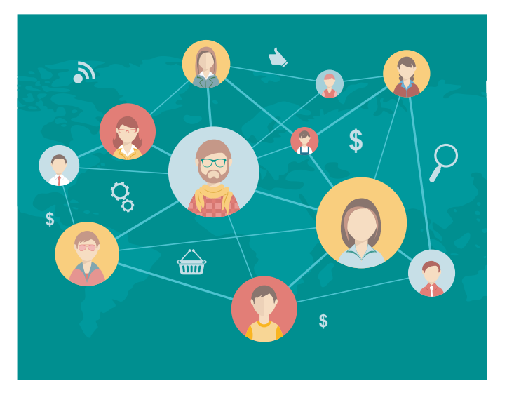
Fig. 1. Structure of a social network.

work is created for the purpose of establishing dialogues, consulting doubts, and even carrying out tasks. In order to take advantage of its social capacities, it is recommended that it be made up of a significant number of participants.